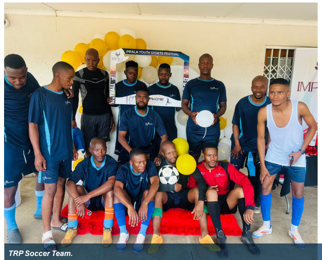
TRP Soccer Team.

The tournament was a reminder that we have committed, capable players with the potential to grow further. We look forward to continued development and improved results in upcoming matches.