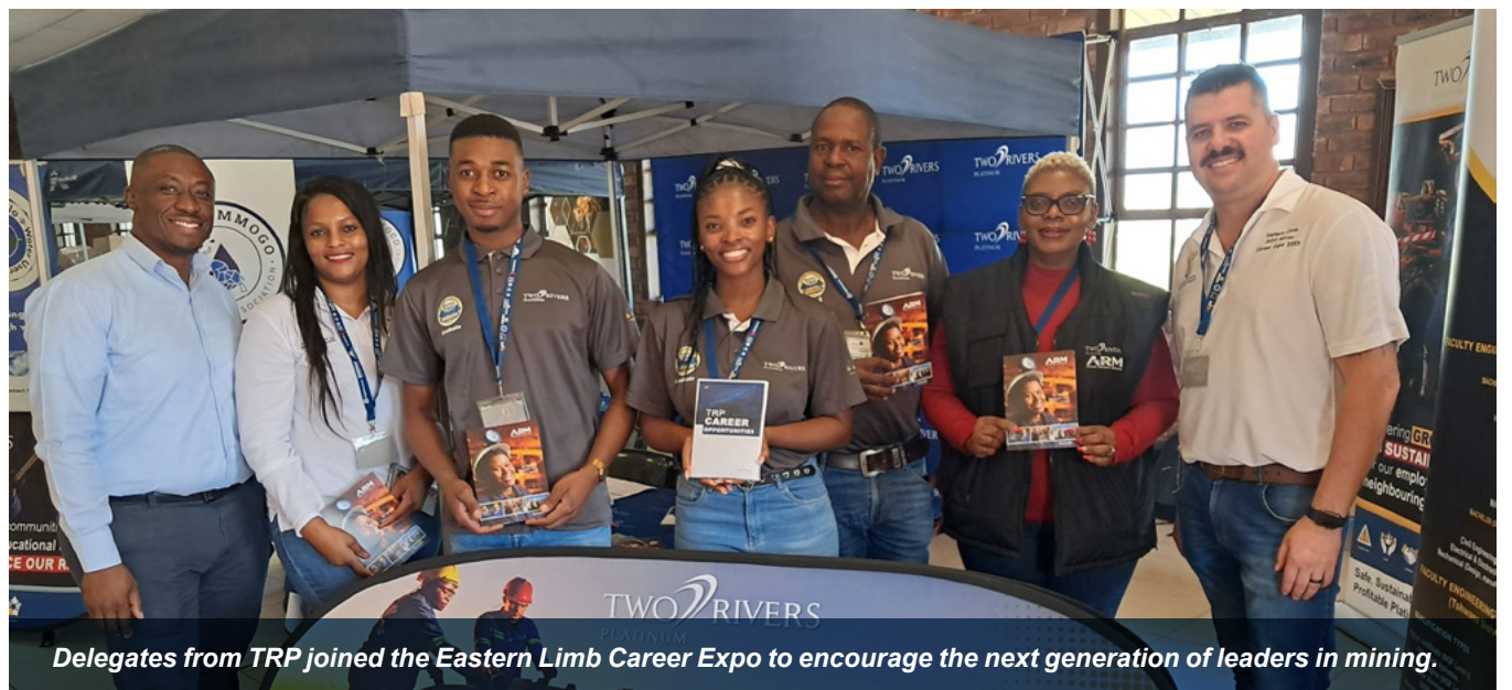
Delegates from TRP joined the Eastern Limb Career Expo to encourage the next generation of leaders in mining.