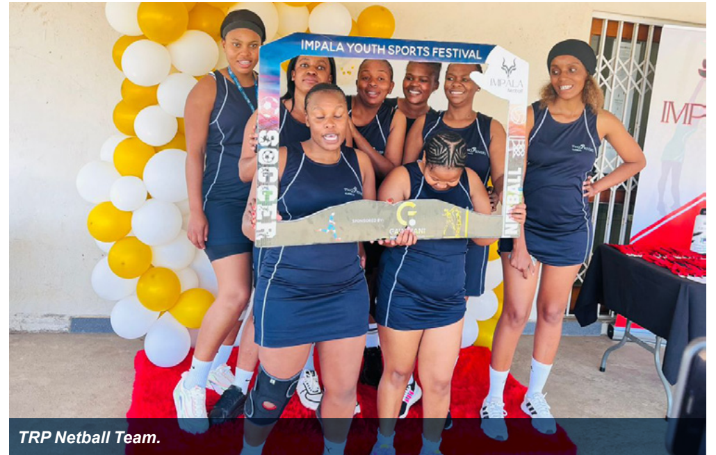
TRP Netball Team.

Showing Commitment, Teamwork, and Growth On and Off the Field.