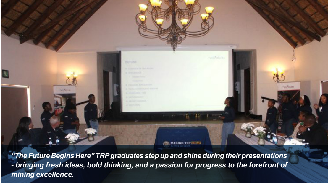
"The Future Begins Here" TRP graduates step up and shine during their presentations - bringing fresh ideas, bold thinking, and a passion for progress to the forefront of mining excellence.