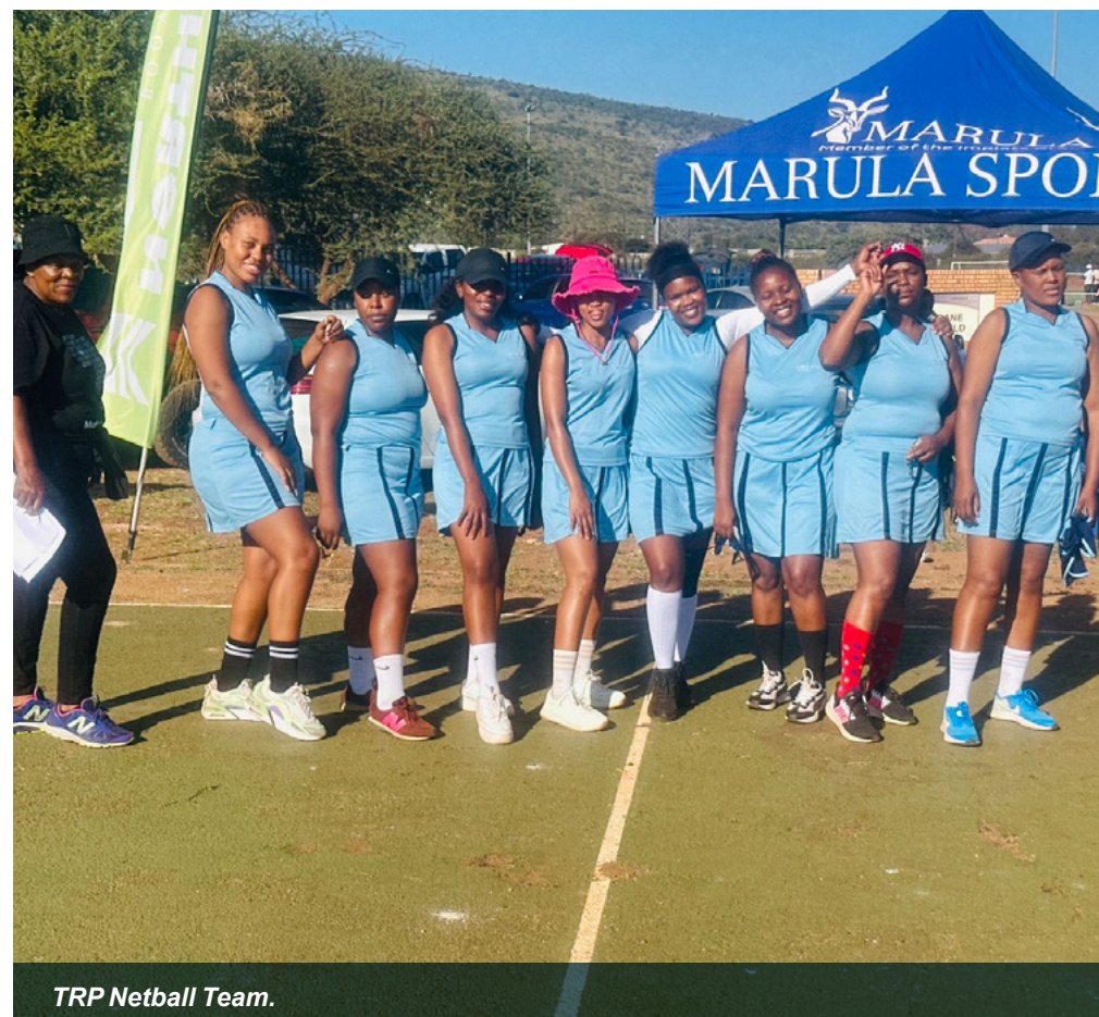
TRP Netball Team.

Being part of a team has many benefits - from improving fitness and mental wellbeing to building confidence and social skills. Colleagues who are interested in joining our sports teams are encouraged to reach out.