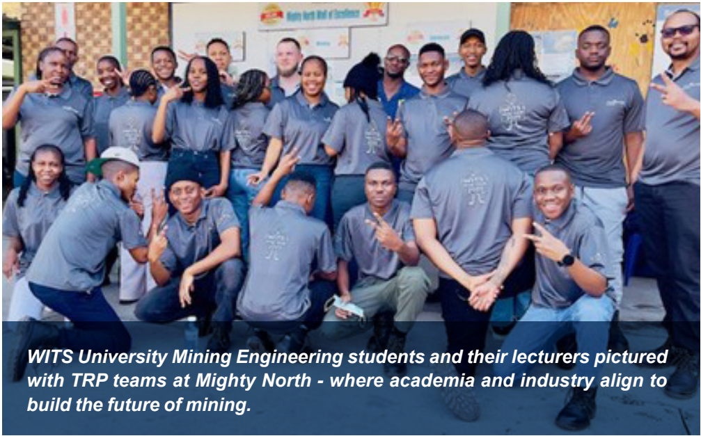
WITS University Mining Engineering students and their lecturers pictured with TRP teams at Mighty North - where academia and industry align to build the future of mining.