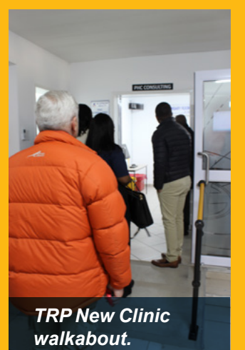
TRP New Clinic walkabout.