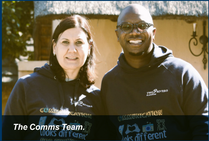
The Comms Team.

We've had some proud moments out in the world too - flying the TRP flag at the Comrades Marathon for the first time, hosting WITS Mining Engineering students at Mighty North, and cheering on our finalists at the Women of Stature Awards. Our TRP soccer team also brought home silver at the Impala tournament in Phalaborwa - well done for showing heart, skill, and true team spirit! On top of that, we've